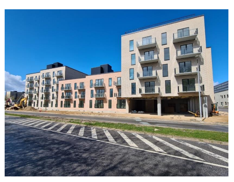
Figure 1 & 2: Ryhavevej 28, Aarhus in the construction phase.